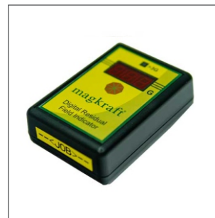
Residual Field Indicators