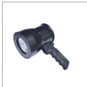
LED UV Lights