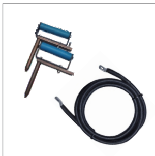
Prods and Cable