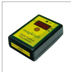
Residual Field Indicators