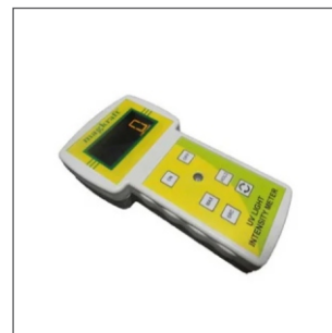
UV Light Intensity Meter